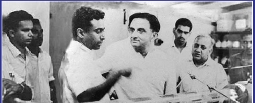
Dr. Sarabhai and Dr. Kalam. A photograph from the early stages of the Indian space programme