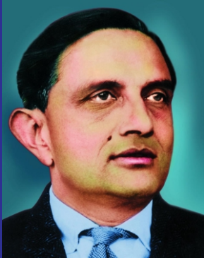
Dr. Vikram Sarabhai